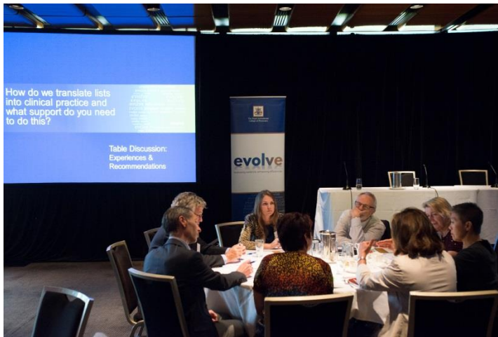
Table discussions saw attendees reflect on the presentations and knuckle down to focus on what works, what gets in the way, and what they can do to take Evolve off the paper and into the clinics and wards. There were thoughtful and lively conversations about what individual Fellows and Trainees could do, and where departments, hospitals, and the College could drive practice change. Many good, practical suggestions were